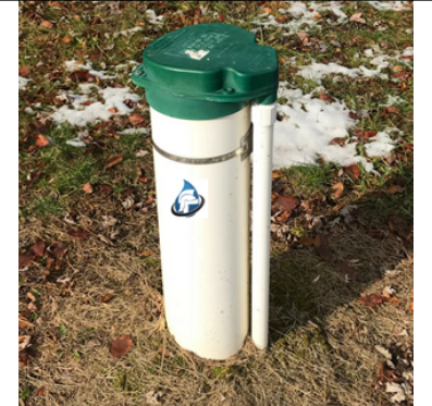
If your property has a well/pond for an additional water supply, the two systems should NOT be tied together at all.