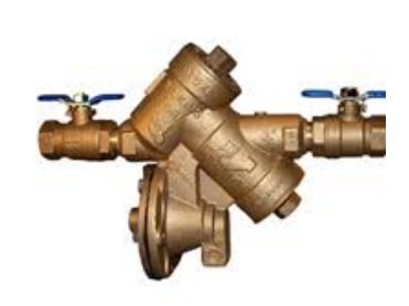
Reduce Pressure Backflow Device – These are required for permanent irrigation systems and on any boiler heating system. These devices shall be tested annually.