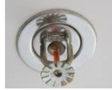
Fire Protection Systems – are required to have a backflow preventer on them. Depending on the type of system, a Reduced Pressure Backflow Device or a Double Check Valve Assembly may be necessary.