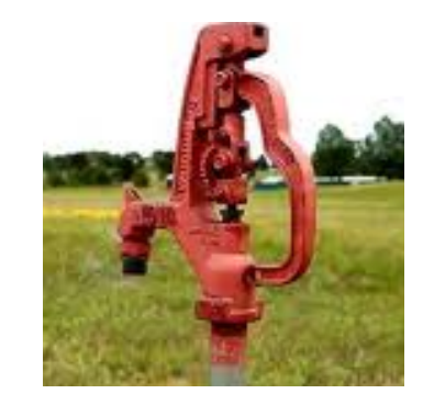
Yard Hydrant – these should have a vacuum breaker or a Reduced Pressure Backflow Device to prevent backflow.