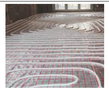
Radiant floor heating – if the system is connected to your home water source, a Double Check Valve Assembly or Reduced Pressure Backflow Device is necessary.