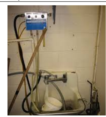
A mop/cleaning sink is present in many homes and businesses. If a vacuum breaker is not installed on the faucet, the non-potable water in the sink could back siphon into the potable water system.